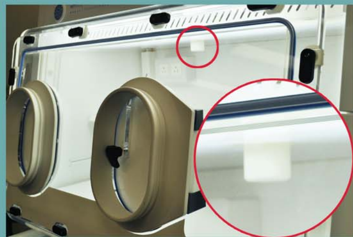
O 2 Sensor located inside the HypOxystation H35

O 2 sensing, monitoring and control are key components to accurate atmosphere control in a hypoxia workstation. The HypOxystation has an integrated O 2 sensor located in the incubation chamber, under the exact environmental conditions as your cell cultures and other samples. This allows for a precise real-time feedback system which constantly monitors the internal atmosphere. HypOxystation can quickly respond to any changes to ensure user settings are accurate and reproducible. Having an integrated O 2 sensor eliminates the need to extract a gas sample and pump it to an external or remote monitoring system for evaluation.